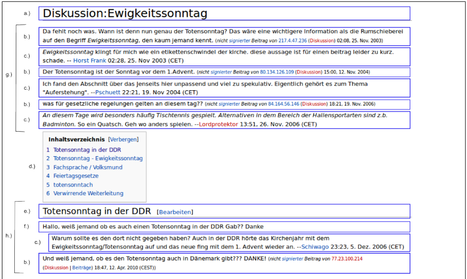
Figure 2: The structure of a talk page (representation adopted from Ferschke et al., 2012): a.) page title, b.) unsigned posting with insertion of IP-address, c.) signed posting d.) table of content, e.) thread heading f.) unsigned posting, g.) unstructured discussion thread, h.) discussion thread structured by indentation