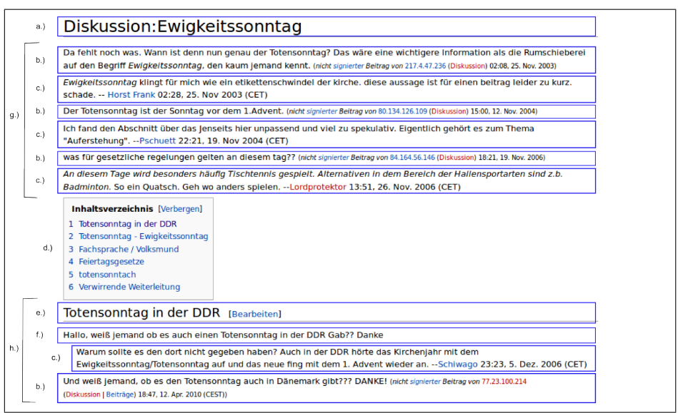
Figure 2: The structure of a talk page (representation adopted from Ferschke et al., 2012): a.) page title, b.) unsigned posting with insertion of IP-address, c.) signed posting d.) table of content, e.) thread heading f.) unsigned posting, g.) unstructured discussion thread, h.) discussion thread structured by indentation