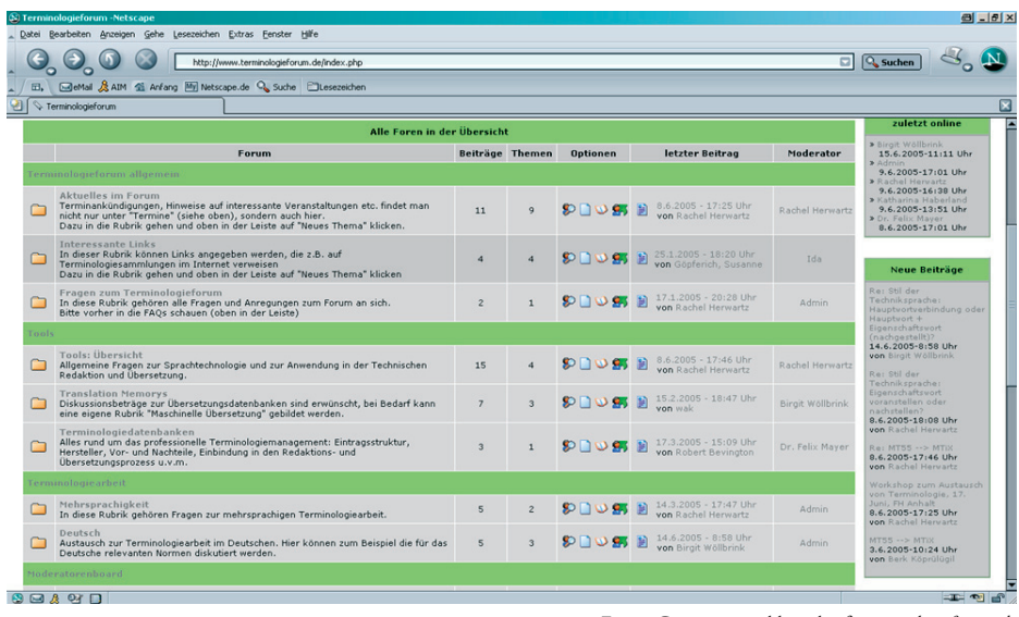
Fig. 2: Categories and boards of terminologieforum.de

Current user languages are German and English, further languages will follow.